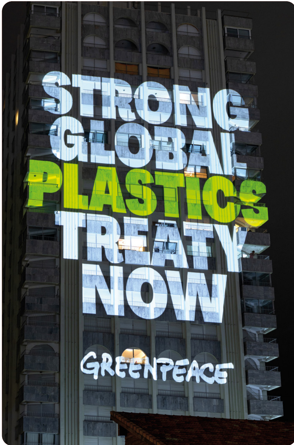
Greenpeace projects messages and plastic waste imagery in Uruguay as global leaders come together to discuss a Global Plastics Treaty in Punta del Este, Uruguay.