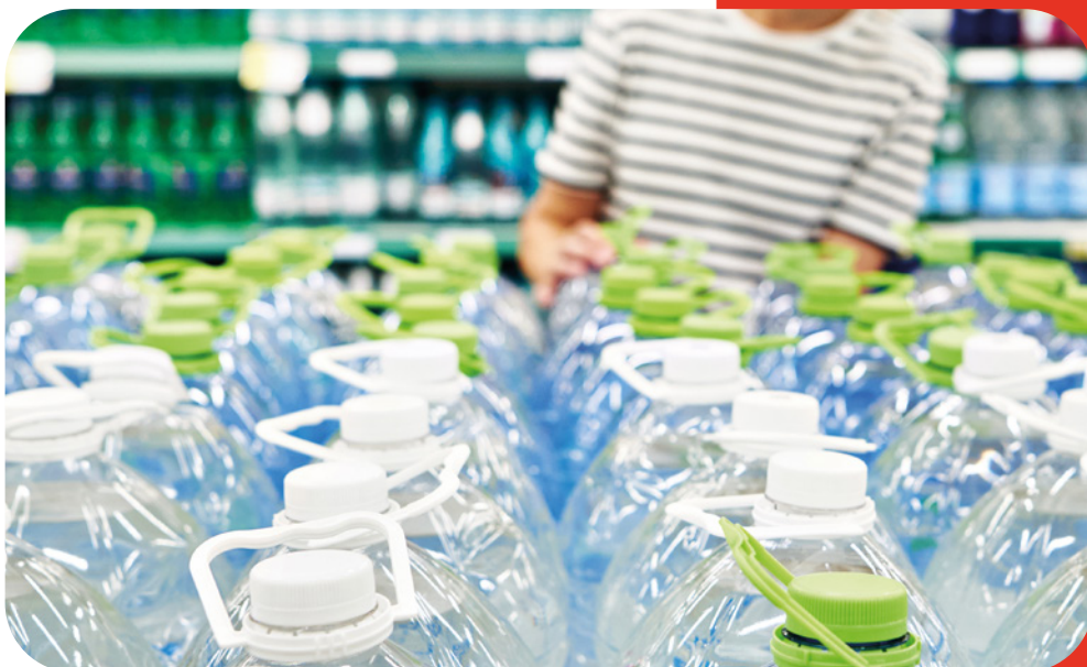
Drinking water in plastic jugs