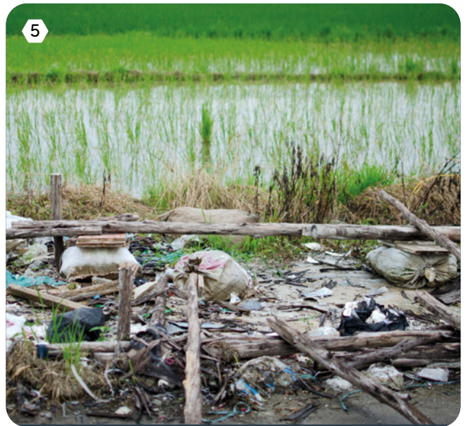
1. Plastic wrapped apples in a Hong Kong supermarket 2. Municipal collection of recycling 3. Plastic in a landfill in China 4. Fish that ingested microplastic 5. Garbage next to rice fields in China 6. Microplastics pollution from the river Rhine in Germany 7. Cooking with eggs