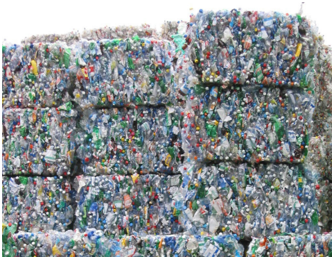
Clear PET bottles bale

Overall the bale quality guidelines and specifications can be used to signal steady and high-quality waste streams, which will aid the recyclers in establishing constant supplies for the production of high-quality recyclates. Furthermore, remaining disparities and fragmentation in collection and sorting systems in Europe can easily be identified with the application of such guidelines.