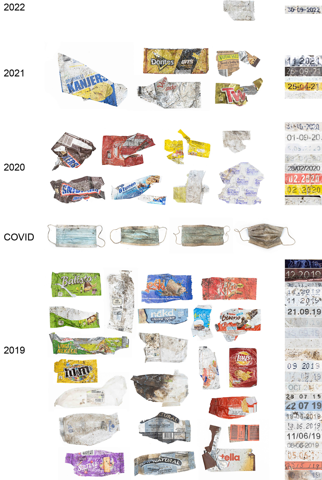
FIGURE 2 Dateable plastic from the Onbekendegracht nest made by common coots, Amsterdam, The Netherlands, which have been deposited in the collection of Museon-Omniversum, The Hague, The Netherlands, with registration number 239121.